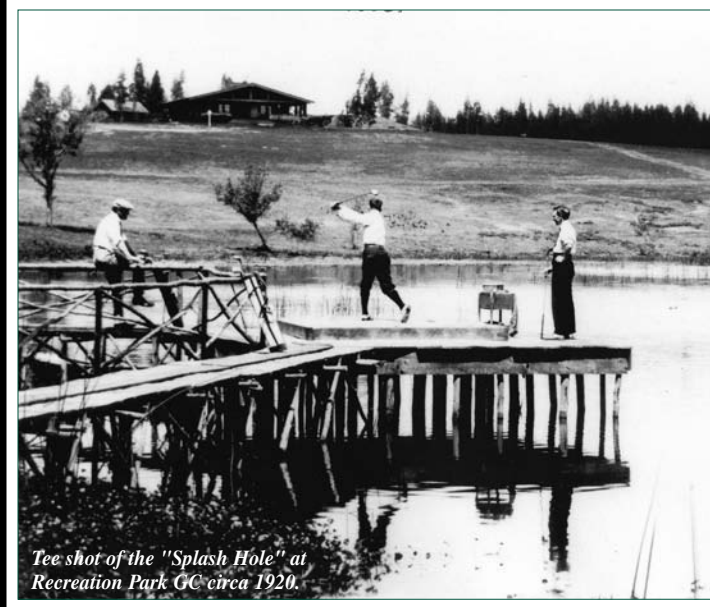
Tee shot of the "Splash Hole" at Recreation Park GC circa 1920.

5001 DEUKMEJIAN DRIVE • LONG BEACH, CA 90804 (562) 494-5000 • www.recpark18.americangolf.com